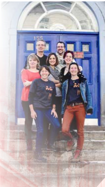
SPOT Clinic team members.