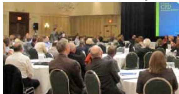
Participants interact with faculty during a panel-speaker session.

Thank you to all who attended and presented at this year's conference. The 3rd National CPD Accreditation Conference will be held in Ottawa, Ontario, at the Chateau Laurier (September 26 and 27, 2011).