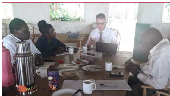
Left: WONCA Africa in Kampala, Uganda—Collaborative meeting