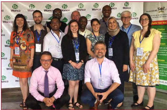
Photo: Besroul Centre colleagues at 6th WONCA Africa Regional Conference, Kampala, Uganda

The Besroul Global Café evolved from the energy inspired by the 6th WONCA Africa Regional conference in Kampala, Uganda, and emerged as an opportunity for members to continue to share and exchange ideas.