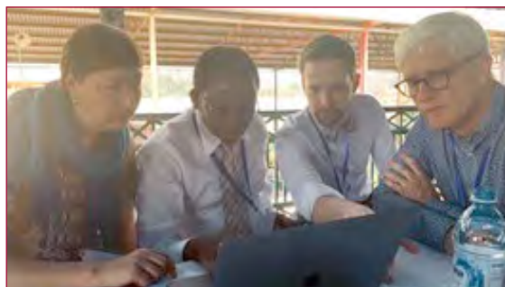
Right: Working meeting in Asembo Bay, Kenya, on mental health primary care integration

In 2020 the Besrour Centre expanded its partnerships to include middle- to high-income countries. We supported capacity development by assisting with health reforms and providing resources and recommendations as they relate to health access, equity, and care for all. As a network resource for co-learning, we recognized the strength to support capacity building. In keeping with its altruistic mission, resources that came to the Besrour Centre as a result of the support offered to middle- to high-income countries were directed to support partnerships with low-income countries.